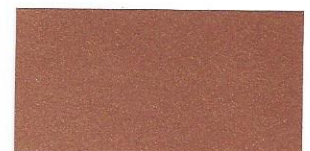
Copper Metallic † ◇